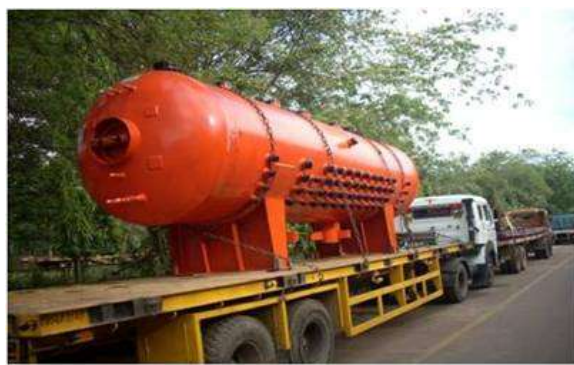
Inadequate support, improper chain lashing and tacking to the base