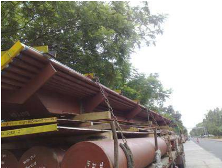
Example., see the wrong loading - Loose pipes of various sizes + a set of panels + Burner Panel over that) Also see improper slinging.

26.2.11 The loading of multiple components one over the other shall not be done.