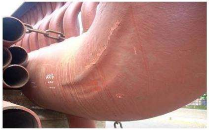
Improper lashing metal chains which can cut into the tubes.