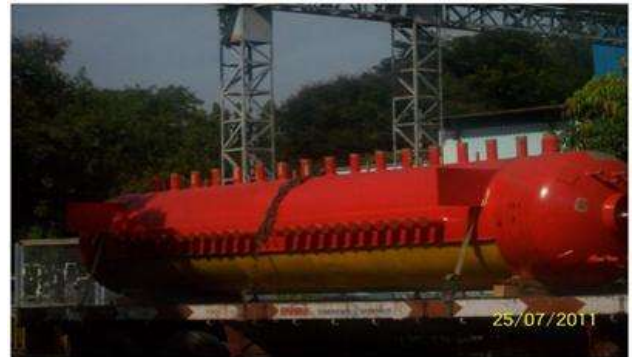
Example of nylon lashing. Nylon lashed drum ... but with an unacceptable chain lashing in the middle