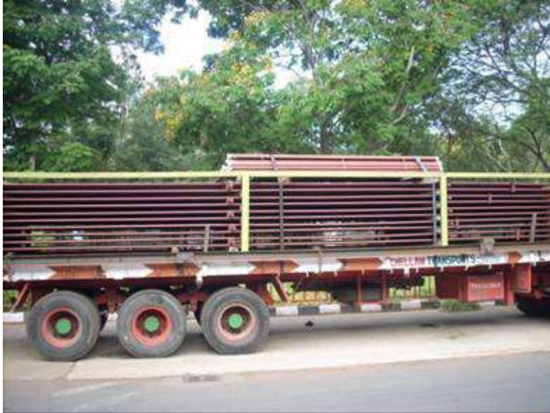
Example of improper loading of a tube bundle over a well-crated coil.

26.2.10 When coils are crated and sent, there must be no bundles of tubes etc. kept over the crate. The crates are not designed to carry any load over them.