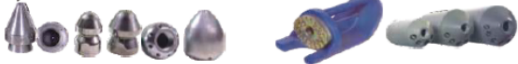
GENERAL CLEANING & DE-CHOKING NOZZLES Conical head, Round head & Elliptical / Egg shaped General purpose, Sewer Line Cleaning Nozzles to suit various pump pressures and flow ratings.

Application: De-choking and de-silting of the sewer, drain and storm water lines and chambers by High Pressure Jetting and Suction by vacuum.