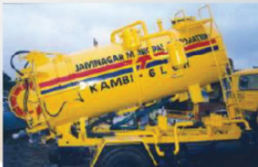
KAMBI 6 LCH