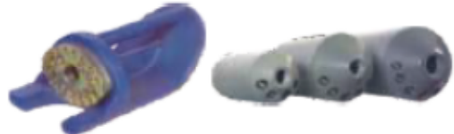
HEAVY DUTY DESILTING NOZZLES Balanced Torpedo, H. D. Flat and Grenade nozzles to suit pressures and high flow rated jetting pumps.