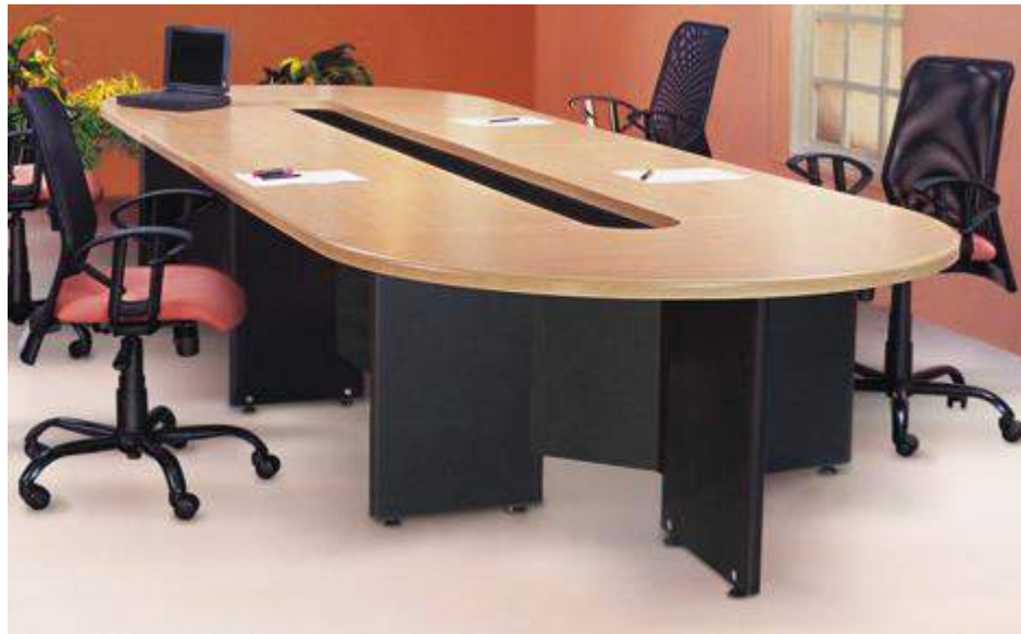
Fig.1 Typical Modular Conference Table

1.0 The conference table in general shall have similar configuration as shown in the fig.1